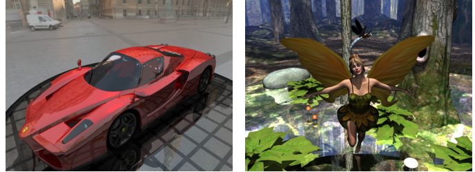
Figure 1: (a) Our system architecture including the SGRT cores and host processor. (b) Rendered images by the SGRT simulator: Ferrari (left, 210K triangles, 1 light source) and Fairy (right, 170K triangles, 2 light sources). The SGRT (4-core) is predicted to render at 67.83fps (Ferrari) and at 87.82fps (Fairy).